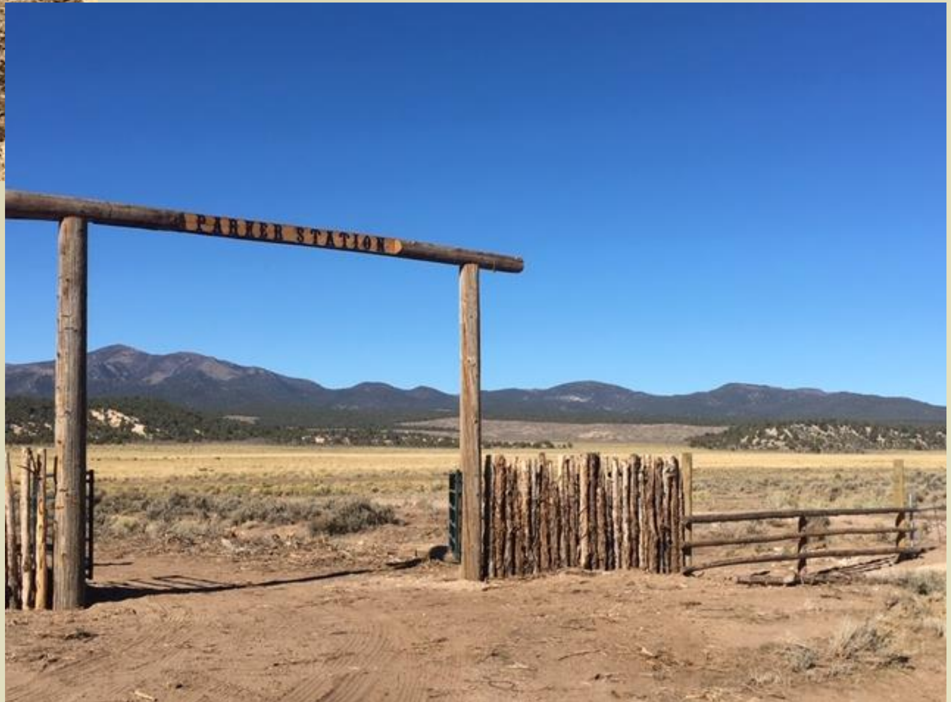
Post-Project: Wildlife friendly fence to protect the spring and a swing gate for cattle control