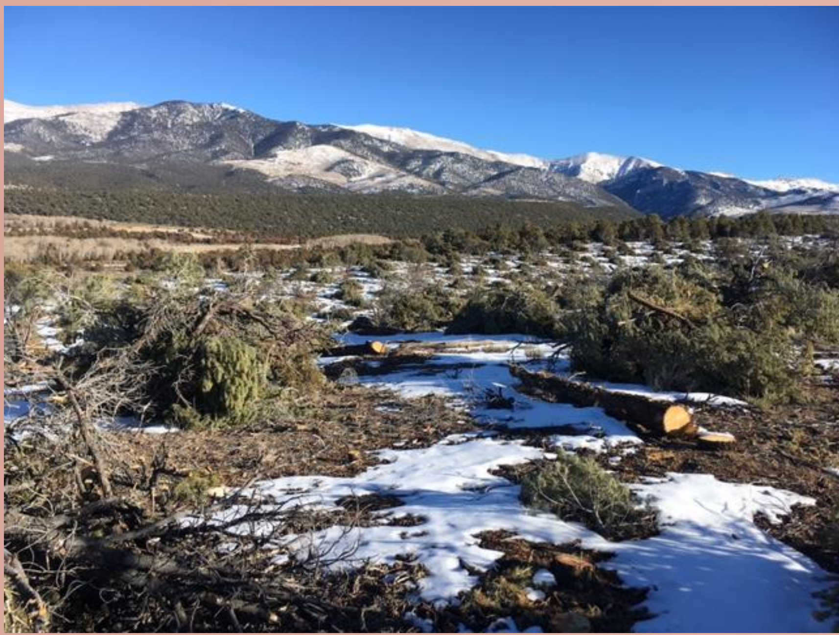
PJ piles ready for burning