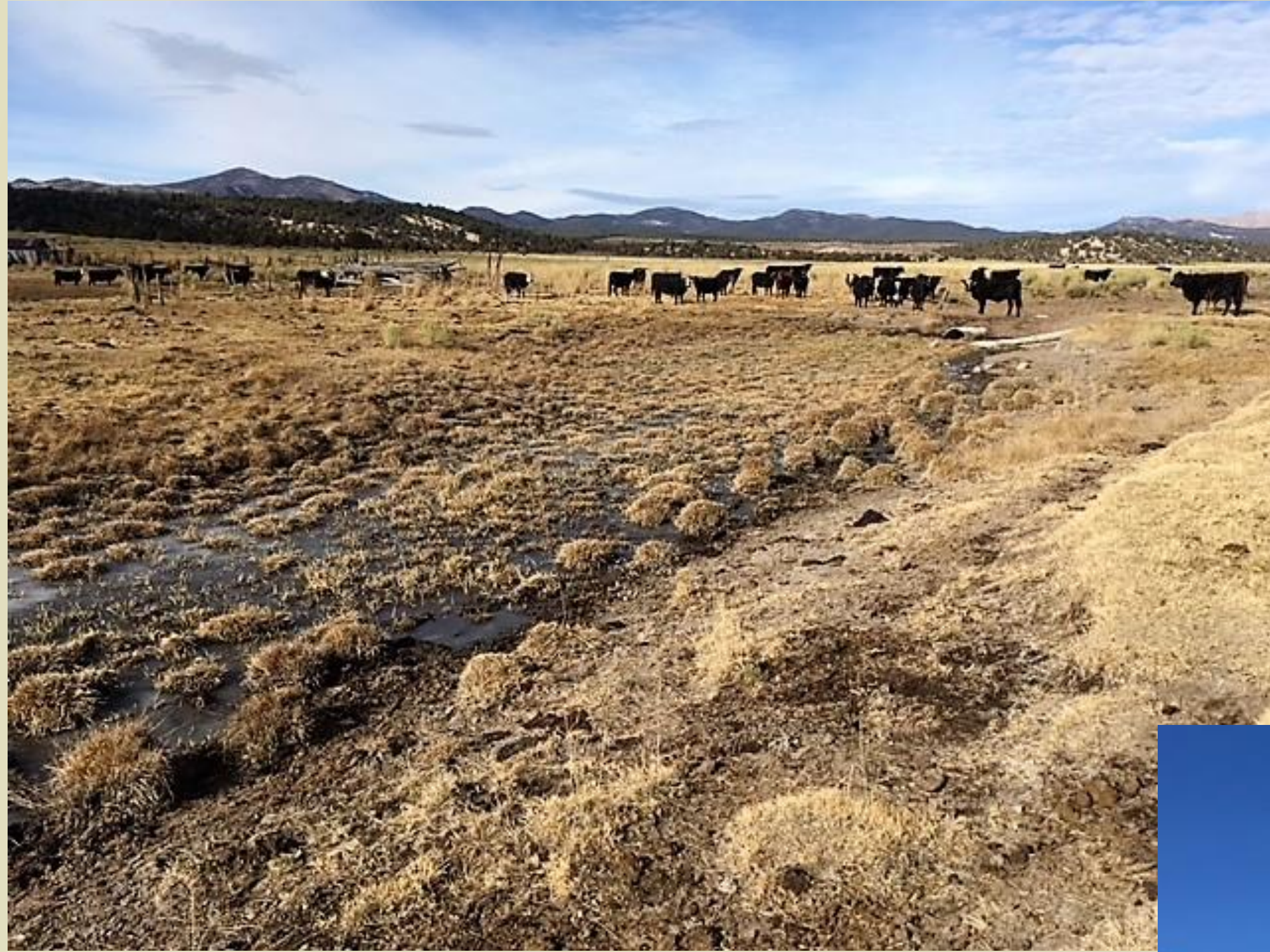
Pre-Project: No fence, cattle come and go as they please

WPCD secured funding for improvements of a vital spring in Cave Valley. The project included fencing off the spring head, while continuing to provide water to livestock. This water source can now return to a more natural state, thus encouraging its longevity. NDOW and NDF partnered on the project.