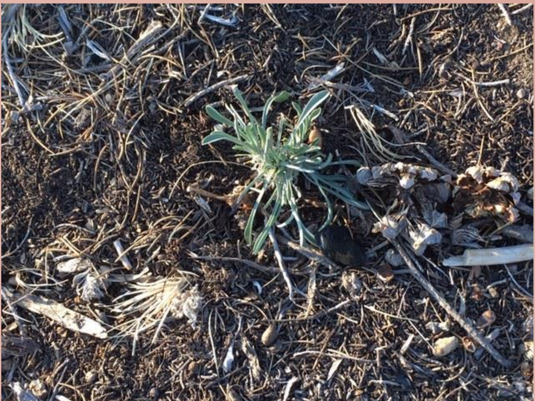
Sage seedlings after PJ removal