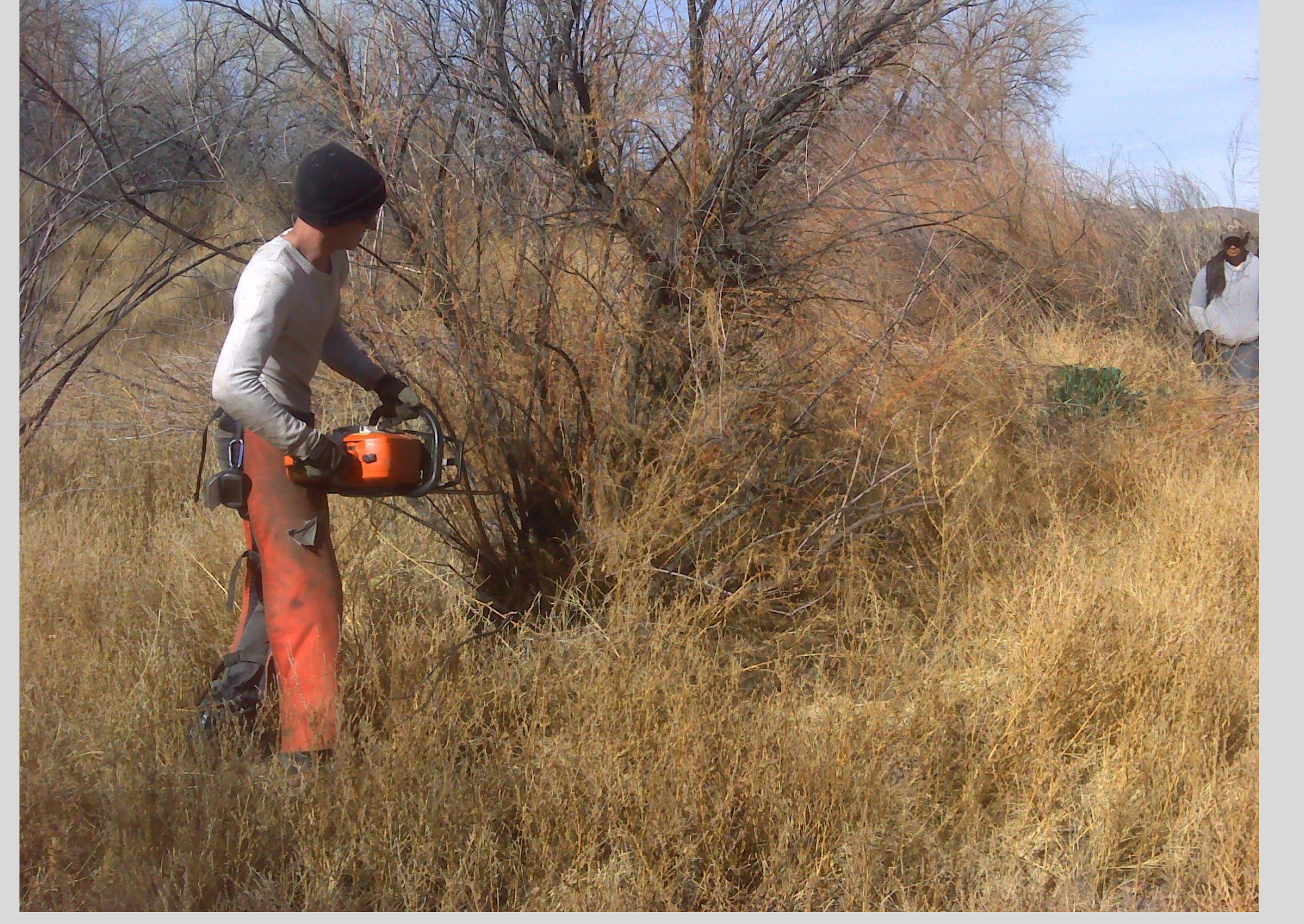
Removal of invasive Pinyon/Juniper and Tamarisk trees to improve habitat for wildlife