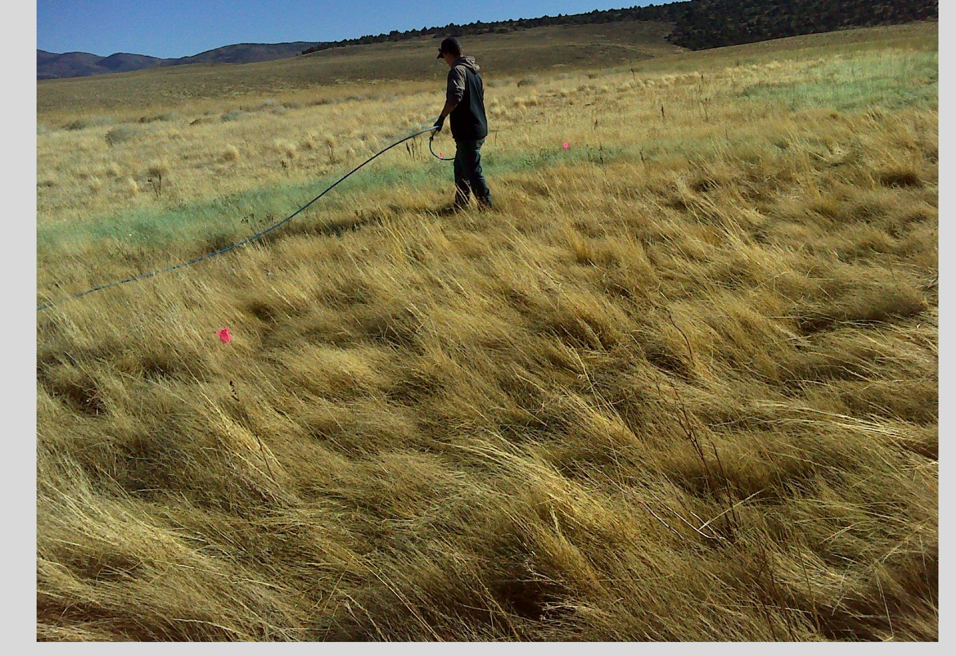
.Aerial and hand application of herbicides to control invasive weeds such as Medusahead