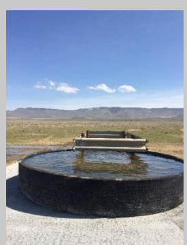
Working with NRCS to insure built structures are wildlife friendly