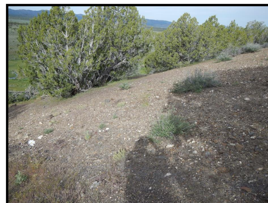
2016 Pre-Cutting Photo

The ECD continues to lead efforts to cut PJ trees down on mostly privately owned lands in important wildlife habitats. The project was focused on improving wildlife habitat, primarily for Greater Sage Grouse, increasing water availability, and providing additional forage for livestock operations. To date, a total of 5,150 acres of PJ within sagebrush habitat have been removed. A portion of the overall project was funded through the Conservation District Program Sage Grouse Habitat Grant. Before and after photos were taken at the locations for the Sage Grouse Habitat Grant.