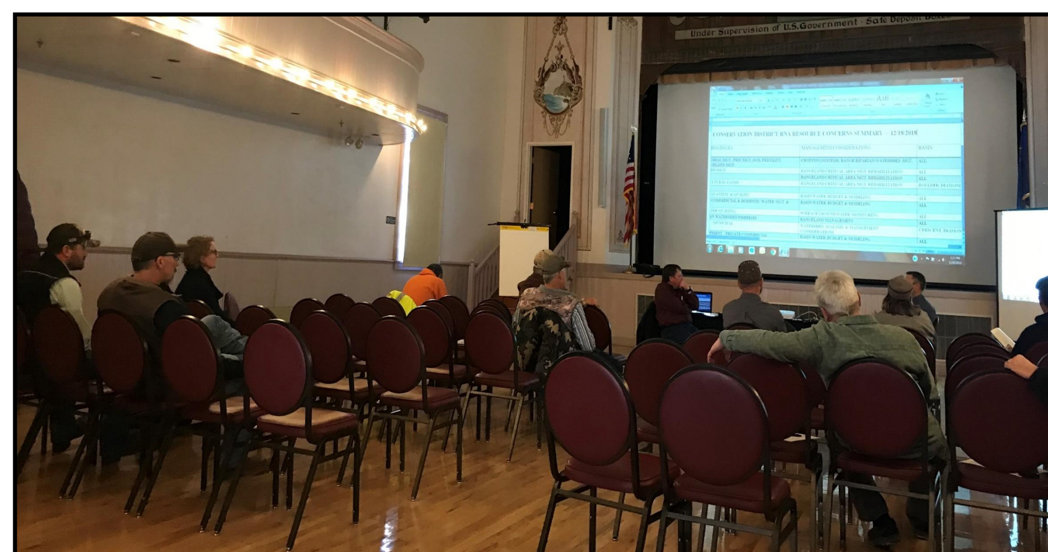
RNA Workshop 2019

The ECD committed to be one of seven Conservation Districts in NV to complete a Resource Needs Assessment through funding received from USDA-NRCS and NACO. The Resource Needs Assessment is being created to identify the resource concerns in the area. By determining those concerns ECD will be able to create plans for the resource needs and also be able to use that information to apply for funding. This will also help with funding opportunities and with leverage when collaborating with agencies and landowners. The process is open to ensure local priorities are considered.