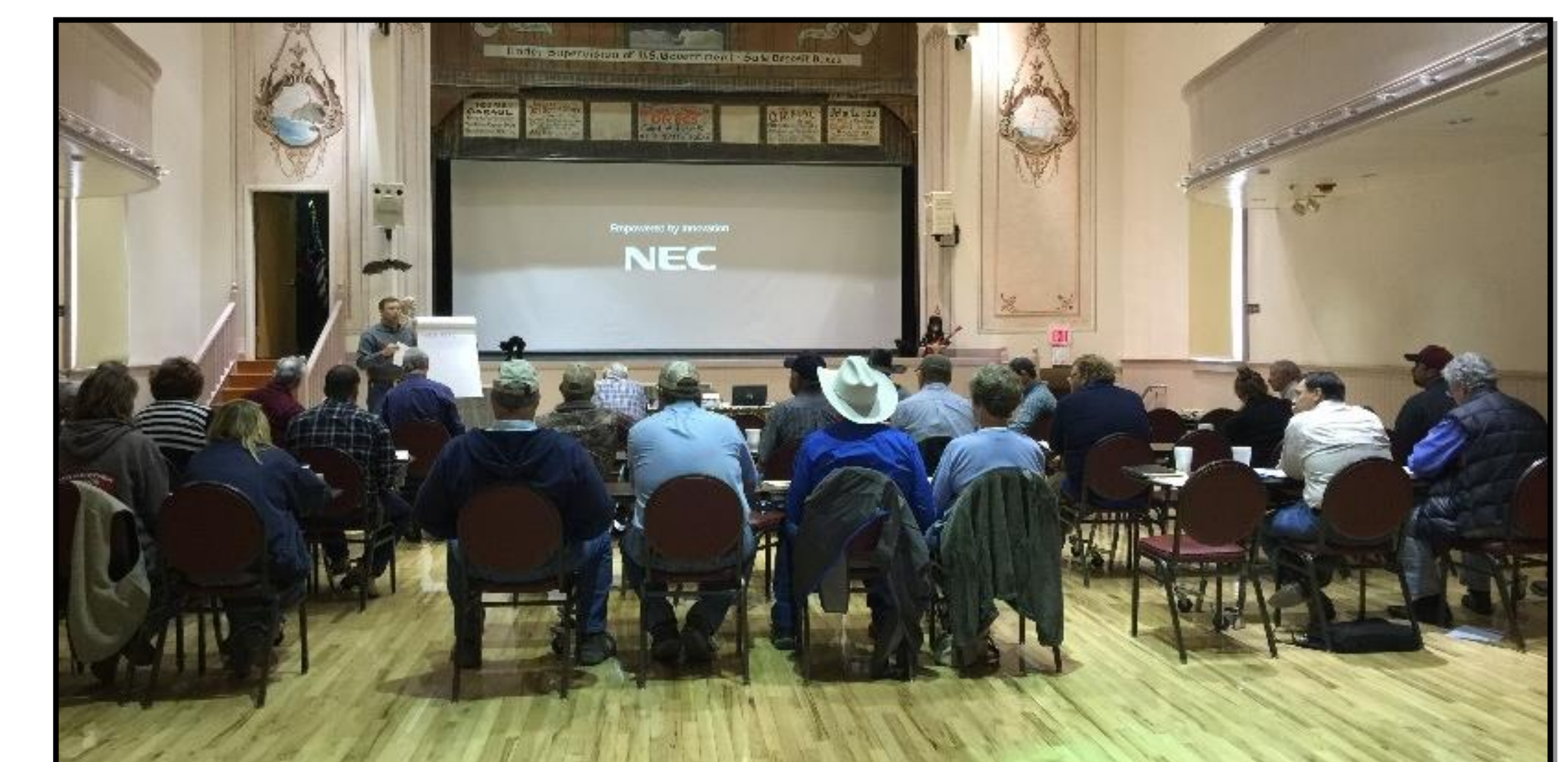
DV-GMP Meeting 2018

The ECD has been participating in and facilitating the development of the DVGMP in order to better understand alternatives for the water issues being faced in Diamond Valley (DV). DV is over pumped resulting in a water table decline and unsustainable use. Two-thirds of the population of Eureka County derives their water from DV and DV hosts roughly 200 center-pivots and contributes millions of dollars to the local economy. The DVGMP is now completed. The call for signed petitions happened in August of 2018 and it was determined that the majority of signatures by permit holders had been met. The State Engineer then reviewed the plan and scheduled a hearing in October 2018 to receive testimony. In January 2019, the State Engineer released Order #1302 Granting Petition for adoption of the DVGMP.