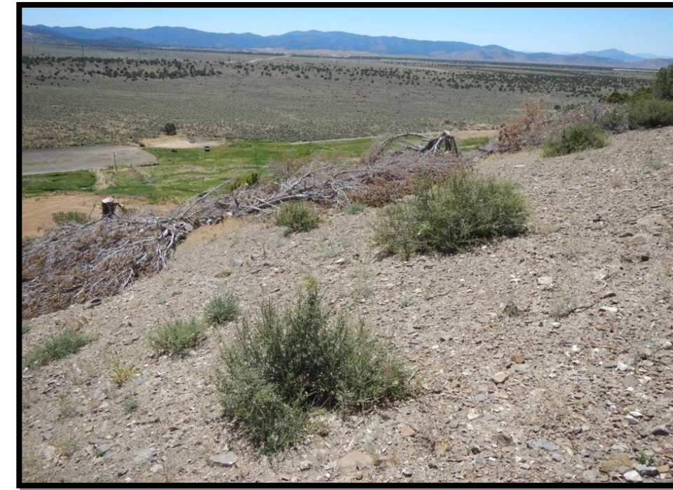
2017 Post-Cutting Photo